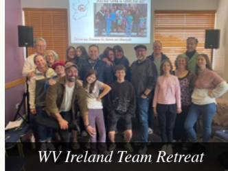
WV Ireland Team Retreat