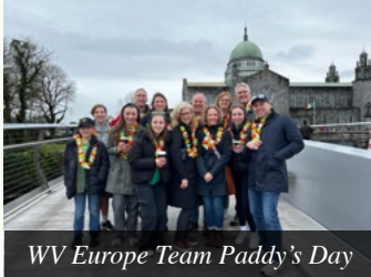
WV Europe Team Paddy's Day